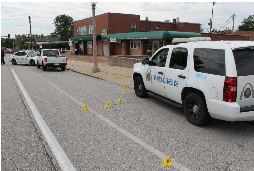
Shell casings on driver side of car at scene.