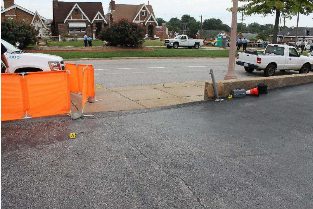
Scene from parking lot of nearby business.