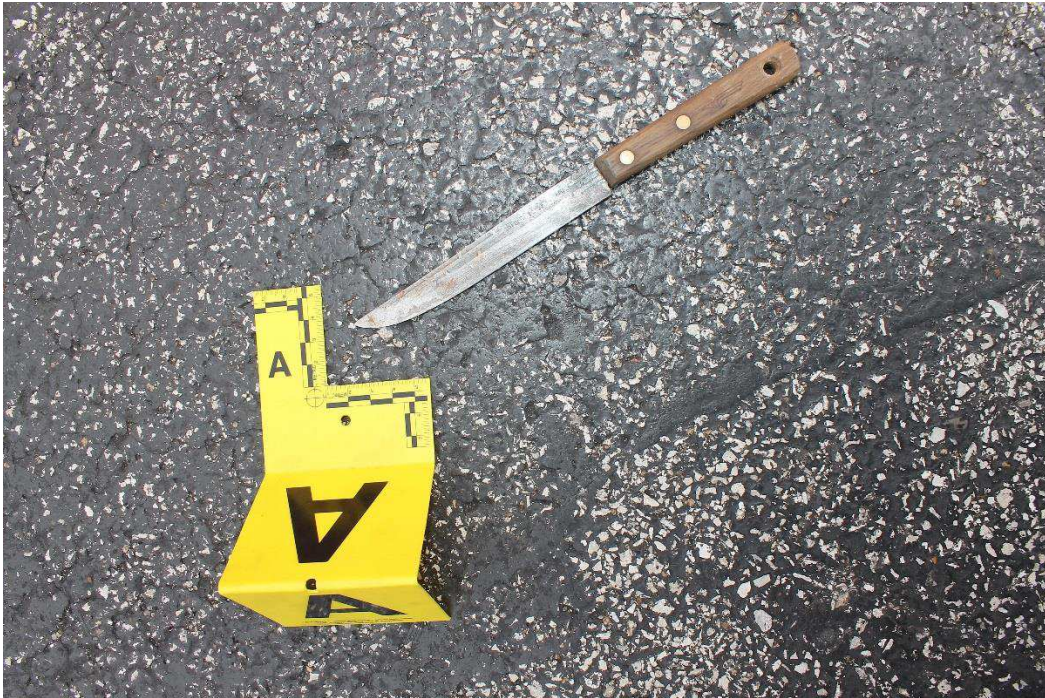
Knife on ground at the scene of the shooting.