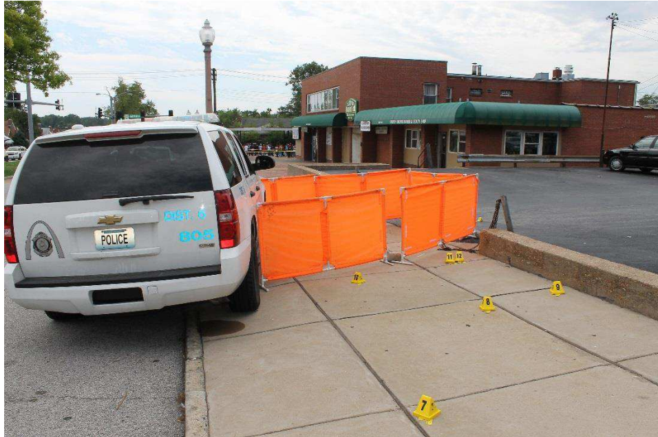
Shell casings on passenger side of car at scene.